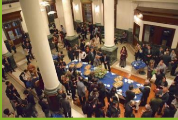
Chiba City Museum of Art

Take advantage of Chiba prefecture's sophisticated urban spaces and vestiges.