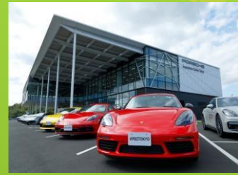
Porsche Experience Center Tokyo