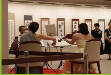
Naritasan Museum of Calligraphy